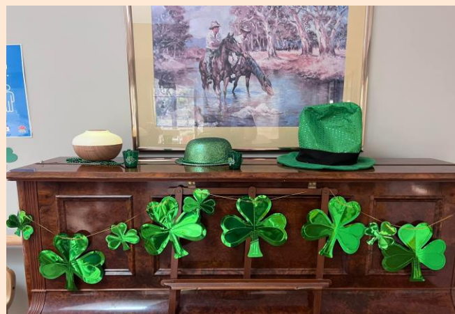
St Patrick's Day 2022

We have a hairdresser who attends every Tuesday. If you would like an appointment please ask a staff member to write your name down in the hairdressers book.