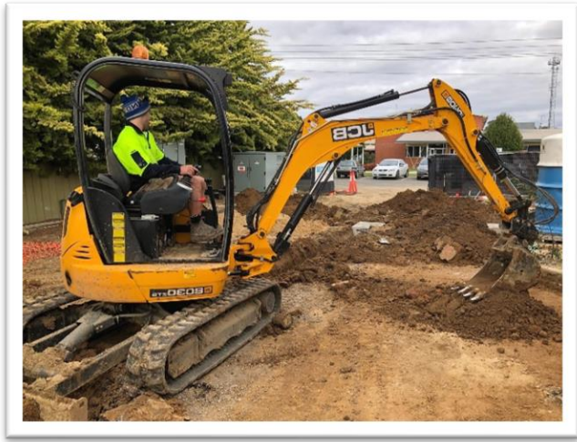
Building works- getting ready for the car park