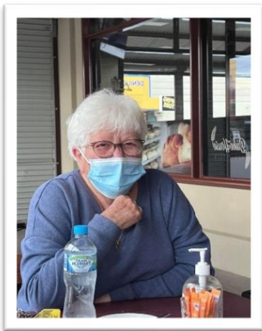
Di – one of our beautiful volunteers