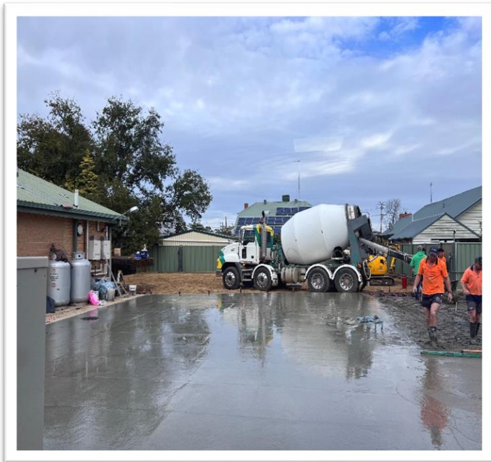
Building works -concreting the car park.